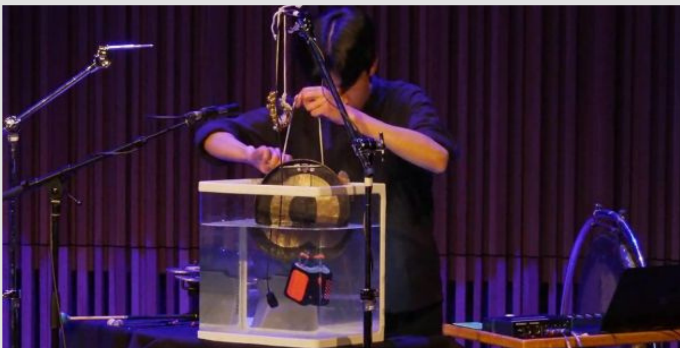
HPG2024 comma means breath.

Supporting students to bring ideas into reality Impact Grants directly realise the student voice into Reality. Under a 2 stage review process, all applications are first shortlisted by Student Peer Leaders followed by a rotating Selection Panel comprised of exec, academic, professional staff; as well as student representation.